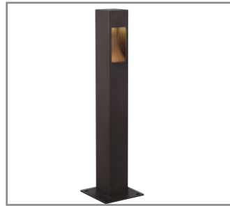
Model: SPJ-CC34 Finish: Matte Bronze