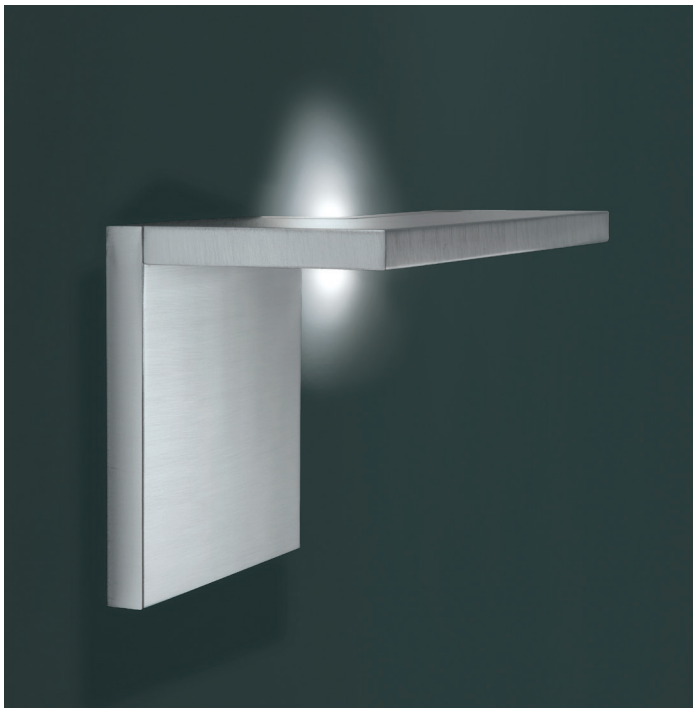
Edge Brushed Aluminum BA